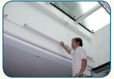
Cleaning of the Buddha Relic Chamber and Shrine Hall prior to Vesak