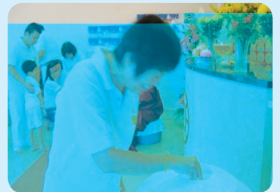
Placing the paper lotus into the “Wish Fulfilling” Lotus

As explained by Bhante Gnanarama in his Vassana message on page 1 and 2 and Bro Hemasiri Lim on page 6, the recitation and the act of listening with Saddha (Confidence) to the chanting of Suttas are powerful forces that can not only provide protection in every way and diminish the unpleasantness or uncertainties that one is going through in the current economic environment but also bring about positive changes to one’s life. The belief in the efficacy of chanting Suttas/Parittas to avert fearful confrontations or unexpected calamities, provide protection by warding off sorrows, anxieties and ills is available for all to experience during these three months of Vassana cultivation.