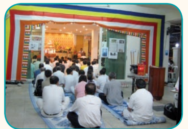
Recitation of the Jayamangala Gathā during the Buddha Relic Candlelight Procession and Evening Pūjā