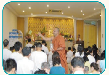
Vesak Day - Homage to the Buddha Relics, Buddha Pūjā and Blessings for members and devotees