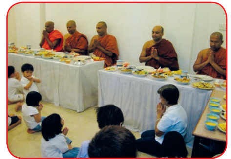
Children offering Dāna to the Bhantes