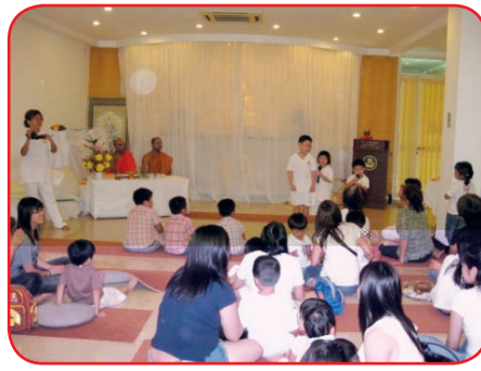
Children entertaining the audience on 27 th Sept