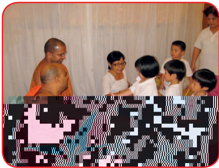
Excited children receiving gifts from Bhantes

Please encourage your children to attend Pūjā at 10.15am to be followed by Sunday Dhamma Classes from 10.45 am to 12.15pm.