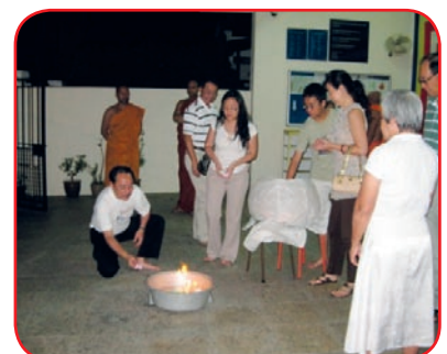
The paper lotuses were ceremoniously burnt